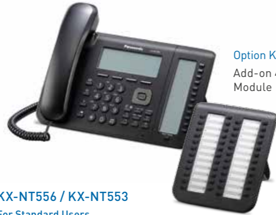
Option KX-NT505 Add-on 48-Key Module